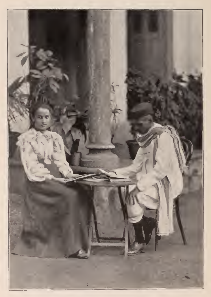
The New Missionary and her Moonshee